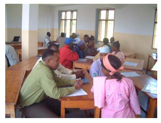
Discussions in the school committee training sessions

committees, and the relationship between the school committee and teachers, parents, the village government and the community. All the participants additionally considered the efficient preparation and running of meetings, the code of conduct among the committee officers and members and the role of the headteacher, and were taken through a detailed analysis of the school budget and their role in its preparation. This was very successful and each committee invited the two trainers to attend their next meeting in order to observe and offer further advice. Later discussions with these schools' headteachers revealed that this was some of the most important help. Support from the communities for their schools has been lacking, and now the school committee members have been informed of their crucial roles and motivated to attend to their duties.