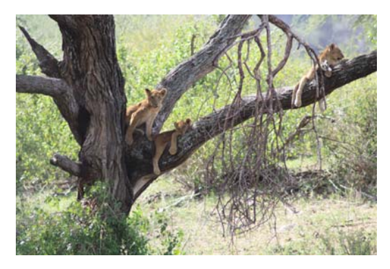
Tree-climbing lions delight the pupils

The volunteers pay a fee to join the teaching programme and this pays for two school outings each year. In August 2008, 25 standard IV pupils enjoyed four days on the coast at Pangani, and in March 2009 a group of 48 pupils from standard IV went to Lake Manyara National Park. For the first time the tree-climbing lions were witnessed and they saw three large cubs sitting comfortably in a nearby tree.