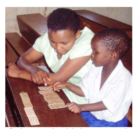
Teachers are now being helped to encourage pupils to think

We are determined to help Tanzania's primary schoolchildren and we see realistic, cost-effective, practical ways of doing so. We hope that supporters, old and new, will help us to help them.