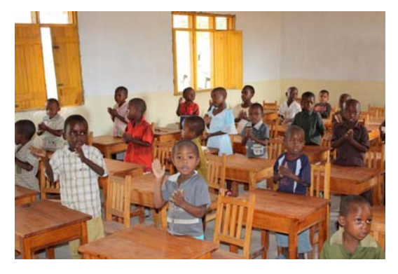
Kochakindo's new pre-primary school

Another busy and successful year, in which our Whole School Development Programme that is working with all parties to improve the quality of primary education, is having a direct impact on the country's education. Our computer centre and our vocational training school continue to serve the community, and plans for development are being implemented, as outlined below. Also our 32nd building project was completed to give Kochakindo primary school its own pre-primary building.