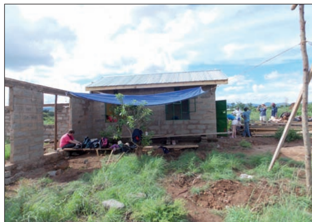
Volunteers from Remit help on the new site

In the meantime we have been lucky to obtain another plot. This may well be even better than the original plot. It is larger and flatter, and has easy access to and from the main road. It has electricity and water supplies on the doorstep. We have 11 acres, and have started to build a watchman’s house and store, as well as a workshop. Proper work on the motor-mechanics school will have to wait until the compensation payment is received. Clearing the site of sisal, bush and scrub took many weeks, and a tree-planting programme is now underway. We are fortunate to have formed a link with Remit Group in the UK, an established provider of vocational training, and they visited with volunteers in April 2013. ( http://www.remit.co.uk/events?id=202 )