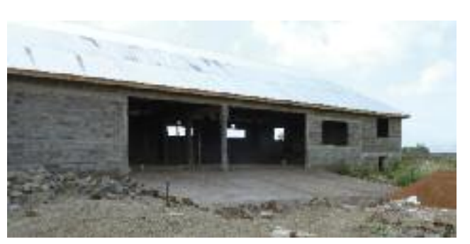
New motor-mechanics workshop

The site is large and so there is plenty of space for a smallholding where the students can help to grow maize, red kidney beans and vegetables for their own consumption as well as for sale.