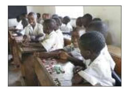
Pupils use dice then cover written numbers to reinforce number recognition

Change in education happens successfully when those involved understand the reasons for it and the benefits that will come from it. What to change and how to do it starts by being with teachers in the schools (ground level), and progresses to cooperation with officials which leads to changes to curriculum, syllabuses, textbooks, etc. (upper levels). The aim of VEPK is to bring the ground level and upper levels together so that lasting improvements take hold. This is ambitious for a small charity, but VEPK is steadily fulfilling that aim.