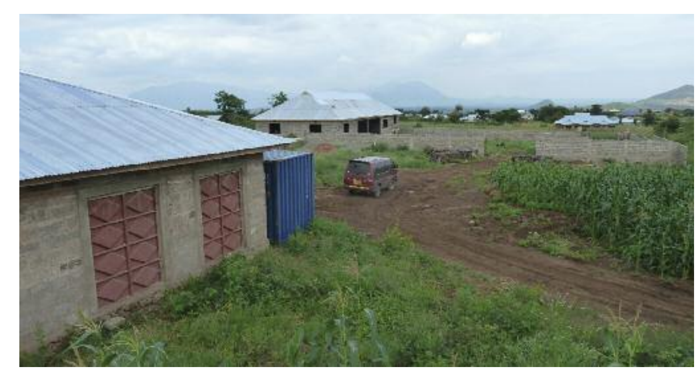
New motor-mechanics centre showing the workshop inside the wall. The three classrooms lie behind the foreground carpentry workshop.

The new site is on the main road from Himo to Moshi which is on a busy bus route and so is easily