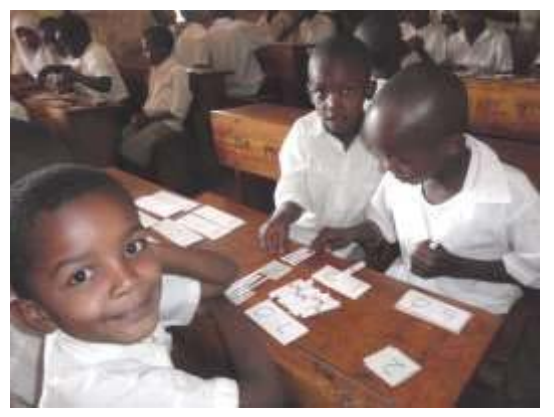
Pupils now understand place-value with the help of straws

In all the in-service training workshops and seminars Swahili is the language used – either by the facilitators themselves or by an interpreter, so that the participants can understand and contribute fully.