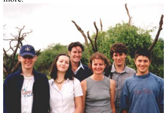
The student teachers this year in Lake Manyara Park

In 1998 the charity started its own 'gap year' programme for native English speakers to help to teach English to the primary school pupils. These student-teachers have an intensive two week training course in England before they fly out to Tanzania in January, and they stay for eight months or more.