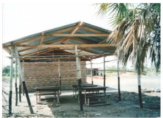
Kochakindo's new shelter is an improvement at least

The community in Kochakindo is ecstatic about the new classroom and shelter, and throughout the work the school committee and members of the village government were exceptionally co-operative. The charity too is delighted that its work has reached out to the lowland areas. If our general funds are sufficient we may consider further work to help Kochakindo.