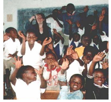
Our overall aim is to enhance the quality of education, especially for village children, in order for future generations to become confident and responsible citizens.

Now in our eighth year we can reflect with satisfaction on what has been accomplished: we are renovating our sixth complete primary school; we have our fifth group of 'gap year' student-teachers; we are in our fourth year of training at the Vocational Training School; we are in our third year helping teachers at the Teachers' Resource Centre: we have taken over 700 children on school outings; we have had 12 adult volunteers and 13 groups helping on various projects in Kilimanjaro, and we are responsible for the salaries of 10 full-time employees in Tanzania. All this is achieved with your help. Thank you very much, everyone, for your generous support of our work. We are achieving excellent results in many varied areas, and our administrative costs last year were just 3.55% of our income. All of the beneficiaries – the pupils in the primary schools and their teachers, the students and graduates at the Vocational Training School and their teachers, and the villagers who benefit from all our work – are immensely grateful. They are appreciative, and they are developing. Developments are slow, but they are there to see and they show every sign of lasting and growing. Thank you.