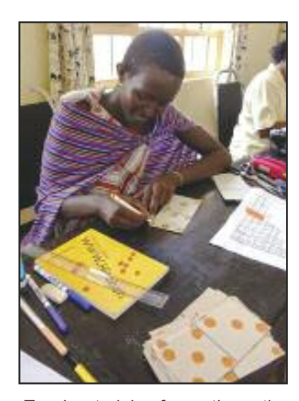
Teacher-training for mathematics

The seminars were enjoyed by the teachers who loved the many activities which use local materials. The teachers discovered for themselves how simple the mathematics is if it is presented properly using objects so that the mathematics is actually seen.