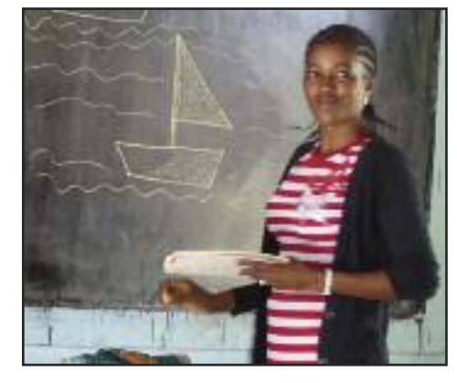
Teacher-training for Jiandae

The Standard III and Standard IV lessons have been encouraging but the teachers needed more help with their own English in order to have confidence in saying what is in